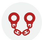
Those in Slavery