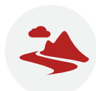
In the way of Allah