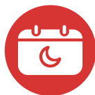
15 Ramadan 2021