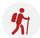
The Destitute Traveller