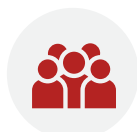
Those employed to administer Zakat