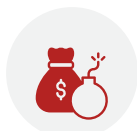
Those in Debt